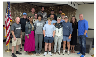
Blaine VFW Baseball Banquet